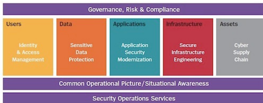
Governance and IT security risk

A corporation may effectively control its most significant business objectives through thoughtful policymaking and vigilant administration. 48 In the critical area of information technology – particularly those businesses eager to employ cutting-edge cloud computing technologies – management’s obligation to exercise sound business judgment is even greater. The most successful companies will thoroughly evaluate the relative risks inherent in the cloud environment and implement effective mechanisms to prevent and mitigate harm to their business. Remember, the new Australian privacy law imposes potential liability on Australian businesses for breaches of the Australian Privacy Principles by their offshore data storage contractors.